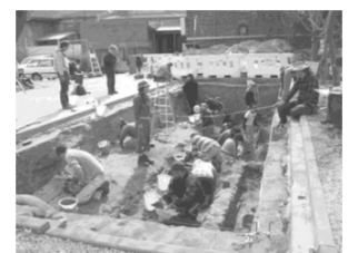
Archaeological dig in Jane Street, Pt Adelaide